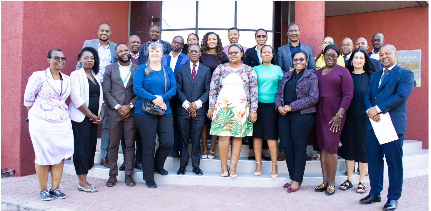
Group photo of BHP staff with the DAIDS delegation