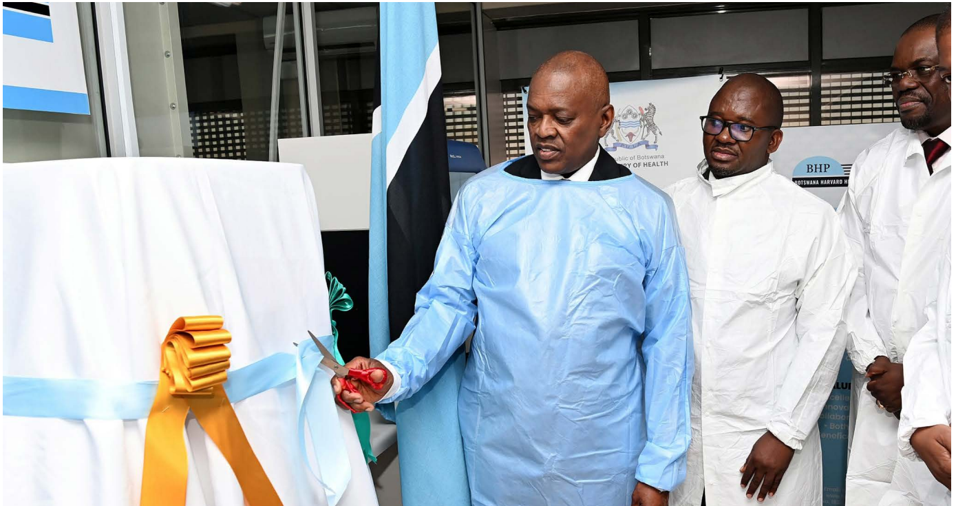
His Excellency Dr Mokgweetsi Keabetswe Eric Masi unveiling the sequencing machine

The Africa Centers for Disease Control and Prevention (Africa CDC) Director General His Excellency Dr Jean Kaseya on Wednesday 30th August 2023 officially handed over a sequencing machine called Illumina NextGen2000 to Botswana Harvard Health Partnership. The NextGen2000 sequencing machine is an advanced laboratory equipment for genomic surveillance. Africa CDC is a public health agency of the African Union that supports the public health initiatives of member states and strengthen the capacity of their health institutions to deal with disease threats.