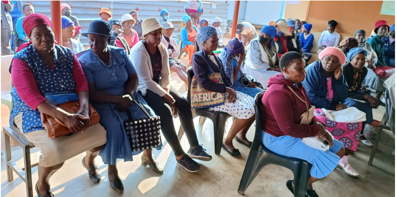
Mmandunyane Community at the clinic

On the 7th September 2023, Potlako+Study Team in collaboration with Nyangabgwe Referral Hospital, Greater Francistown District Health Management Team (DHMT), Mandunyane Clinic and The Fighters Support Group (cancer patients) was in Mandunyane Village educating the community on early diagnosis and treatment of various cancers.