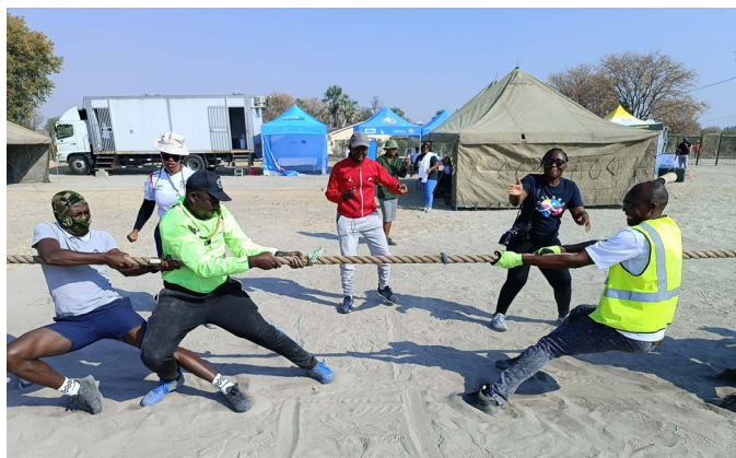
Tug of war at Nata Workers Wellness Day

This event was held in conjunction with Nata Clinic, Nyangabgwe Referral Hospital, Tutume Health District Health Management Team (DHMT) and other government departments, state owned enterprises and the private sector.