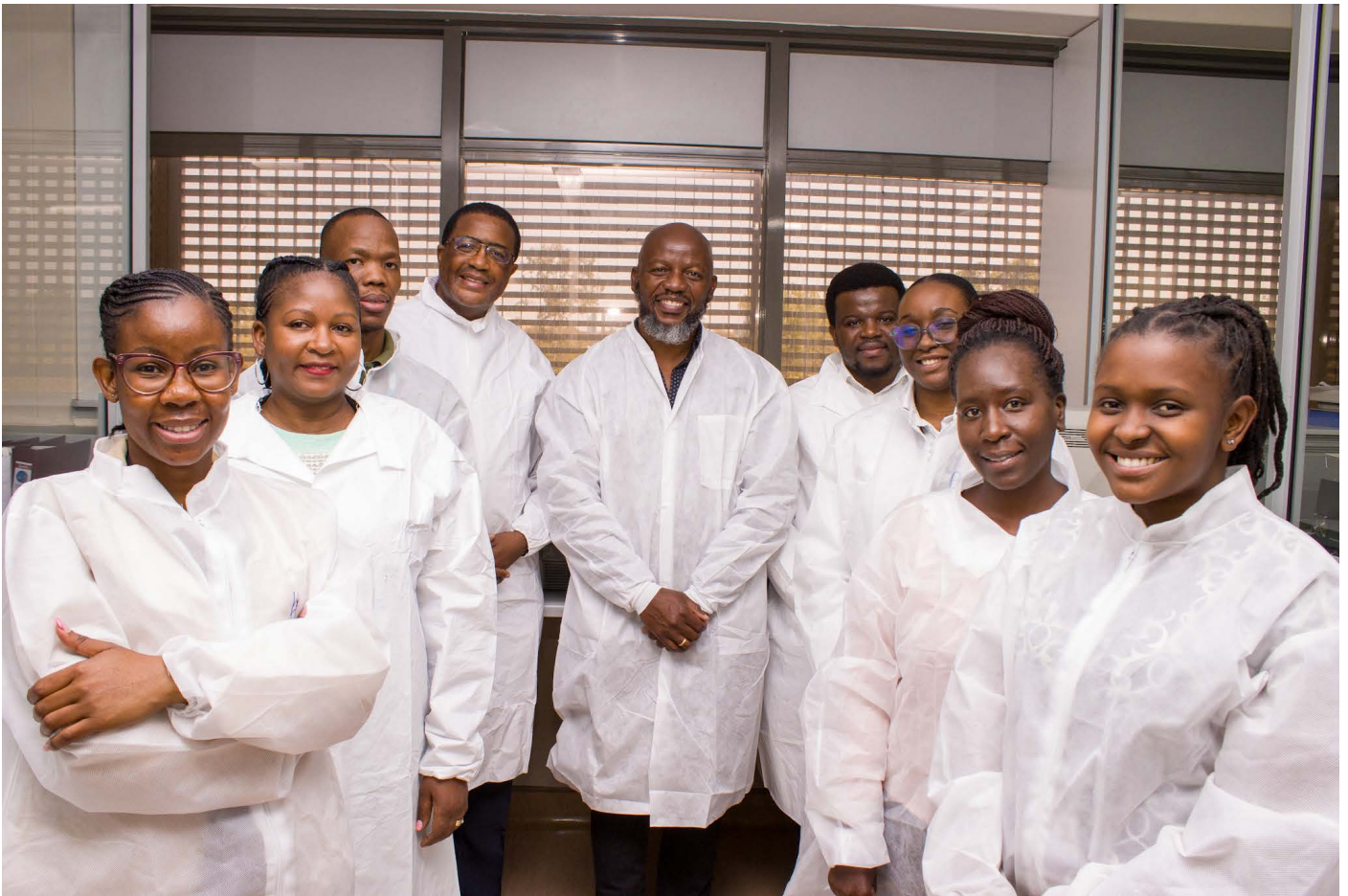
BHP Virology Team ( Presidential Order of Meritorious Service)