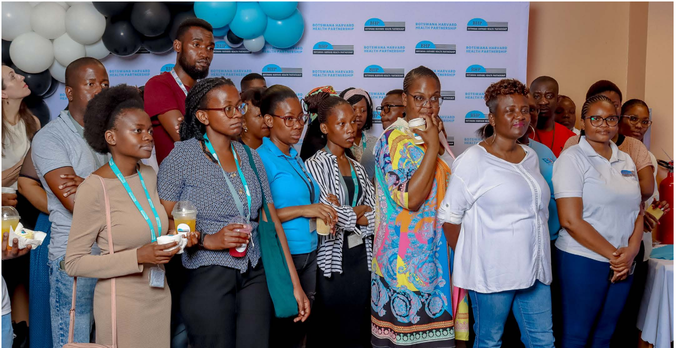
BHP Staff listening attentively to BHP Chief Executive Officer at the BHP new logo launch

The Botswana Harvard Health Partnership (BHP) on the 6th October 2023 launched its refreshed logo which reflects the change of company name from Botswana Harvard AIDS Institute Partnership (BHP). The new registered name; The Botswana Harvard Health Partnership change came into effect on the 1st November 2022. The acronym BHP will remain the same, therefore the organization still remains to be commonly referred to as BHP .