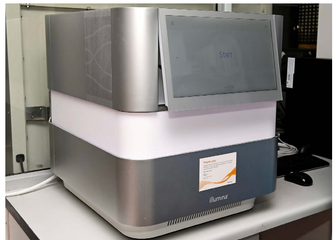
Illumina NextGen2000 sequencing machine

Receiving the gift, His Excellency Dr Mokgweetsi Keabetswe Eric Masi expressed his gratitude to Africa CDC for responding to the needs of Botswana, promising Dr Kaseya that the lab will use the machine for the good of humanity, not only Batswana but all that traverse its borders as Botswana health system does not discriminate.