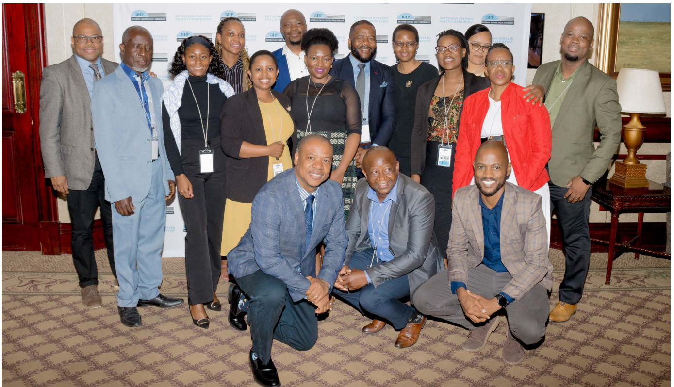
BHP CTU team